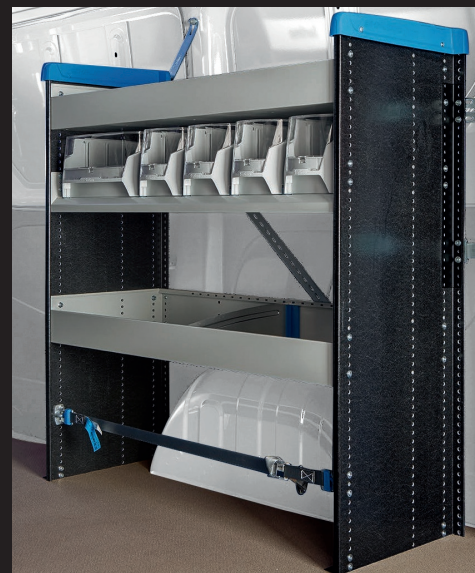
Equipment block on the right-hand side of the loading area.