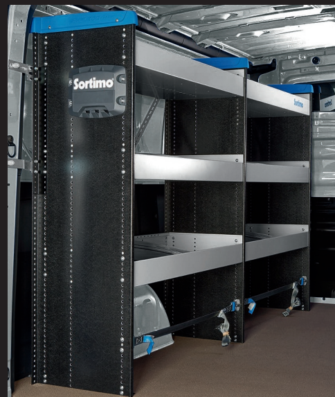
Equipment block on the left-hand side of the loading area.